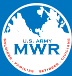
Table Layout Carlisle Barracks Welcome Expo August 7, 2019 • 9 am - 1 pm

DFMWR EMPLOYEE USE ONLY: Staff Signature: _____ Date: _____